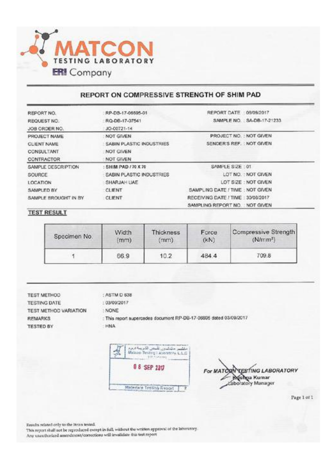
SHIM PAD COMPRESSIVE STRENGTH REPORT