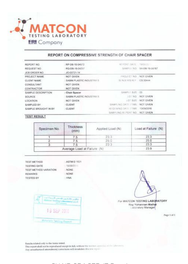
CHAIR SPACER (7.5mm) COMPRESSIVE STRENGTH REPORT