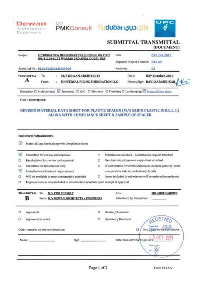
FLYDUBAI HQ - PROJECT